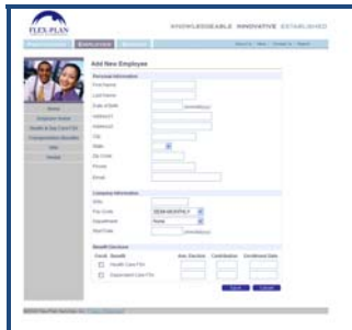
Click thumbnail for larger image